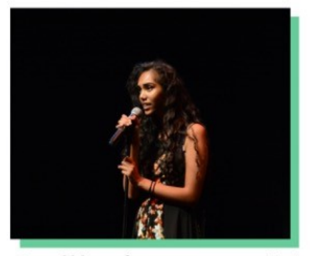
Incredible performance opportunities!