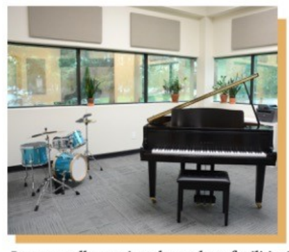
Large, well-appointed, modern facilities!