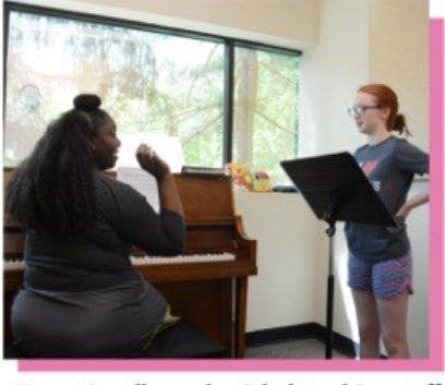
Exceptionally credentialed teaching staff!