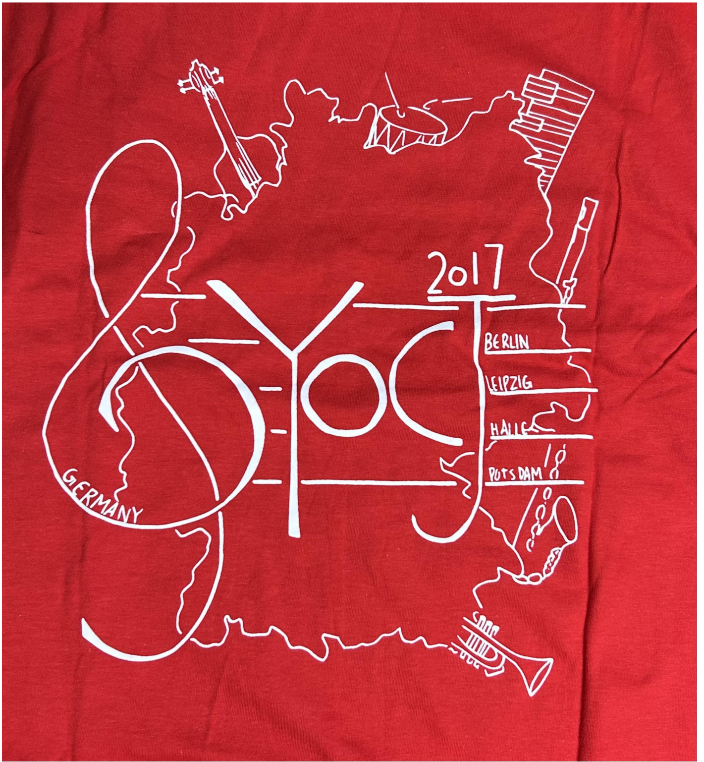
Example of black and white YOCJ logo on red t-shirt: