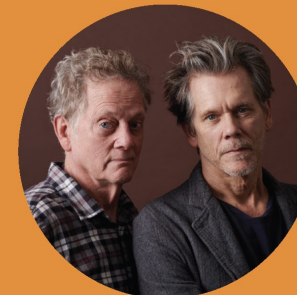
THE BACON BROTHERS Michael and Kevin Bacon June 20