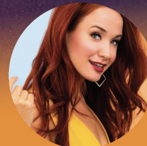
SIERRA BOGGESS June 5